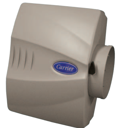
Model SBP Model LBP Model WBP Humidifier