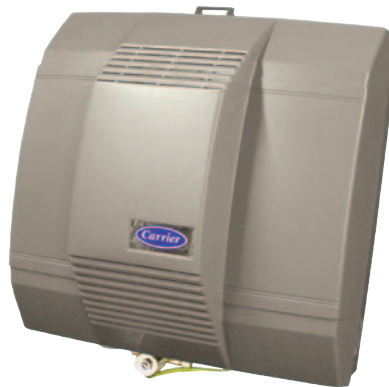
Model LFP Humidifier