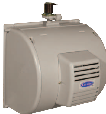
Model SFP Humidifier